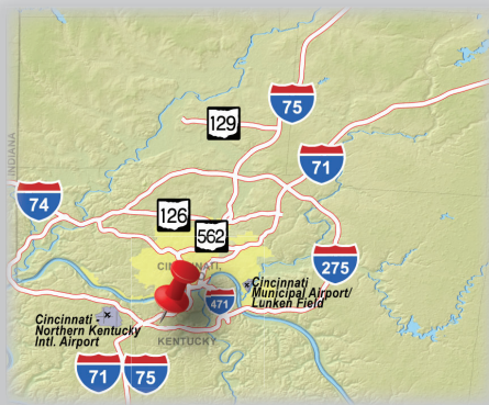
N. Kentucky Retail Submarket